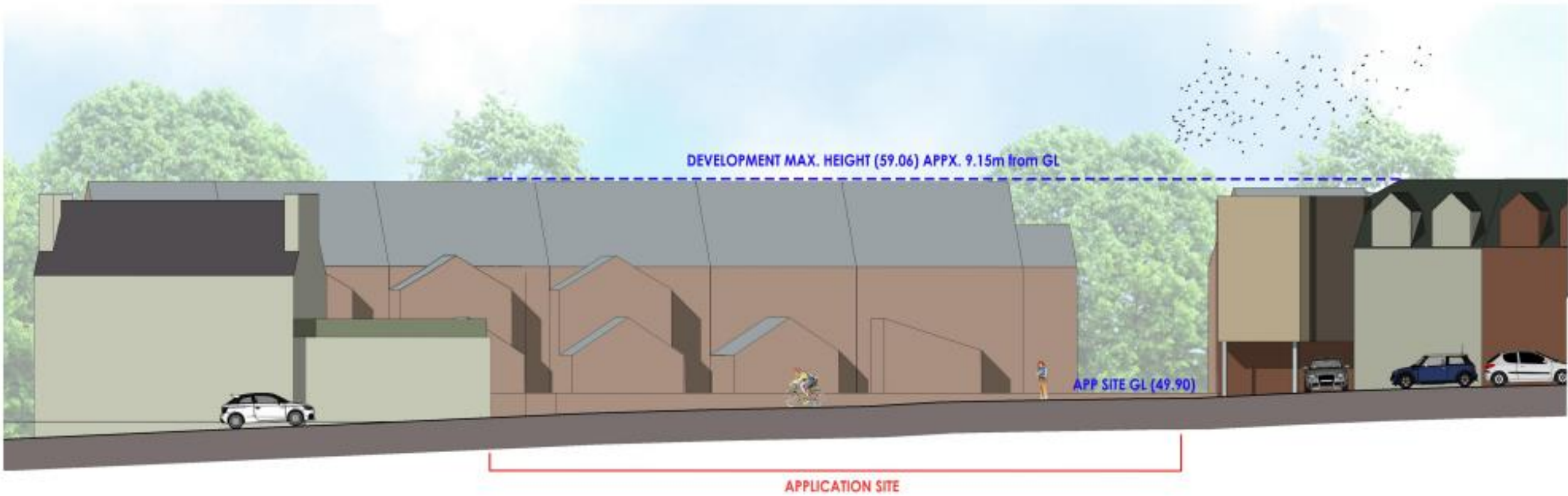
HOWELL ROAD DEVELOPMENT PARAMETERS